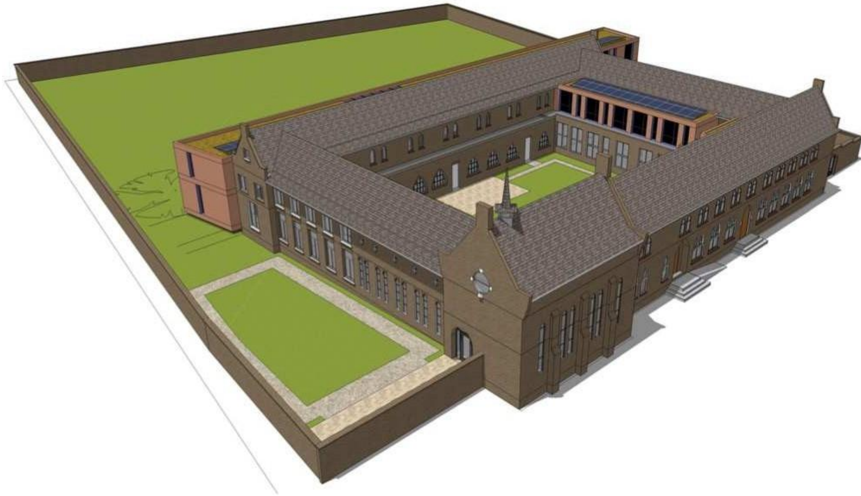
Scene 1, vogelvlucht vanuit het zuidoosten